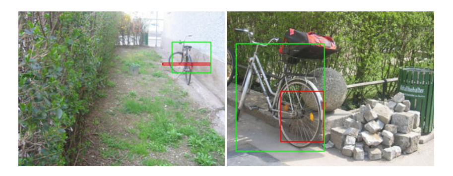
Fig. 1. Subwindow detection for the original NBNN (red) and for our version of NBNN (green). Since the background class is more densely sampled than the object class, the original NBNN tends to select an object window that is too small relatively to the object instance. As show these examples, our approach addresses this issue.