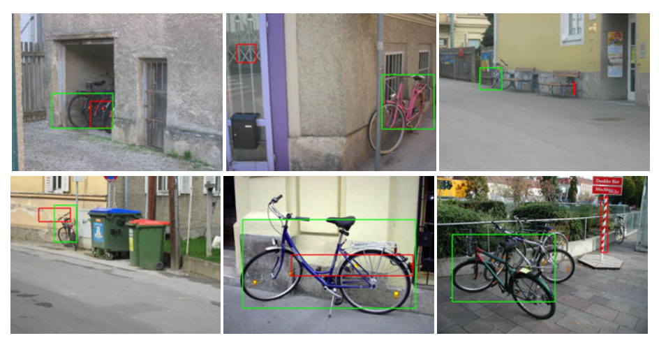
Fig. 3. Subwindow detection for NBNN (red) and optimal NBNN (green). For this experiment, all five SIFT radiometry invariants were combined. (see Section 4.4)

It can be observed that the non-parametric NBNN usually converges towards an optimal object window that is too small relatively to the object instance. This is due to the fact that the background class is more densely sampled. Consequently, the nearest neighbor distance gives an estimate of the probability density that is too large. It was precisely to address this issue that optimal NBNN was designed.