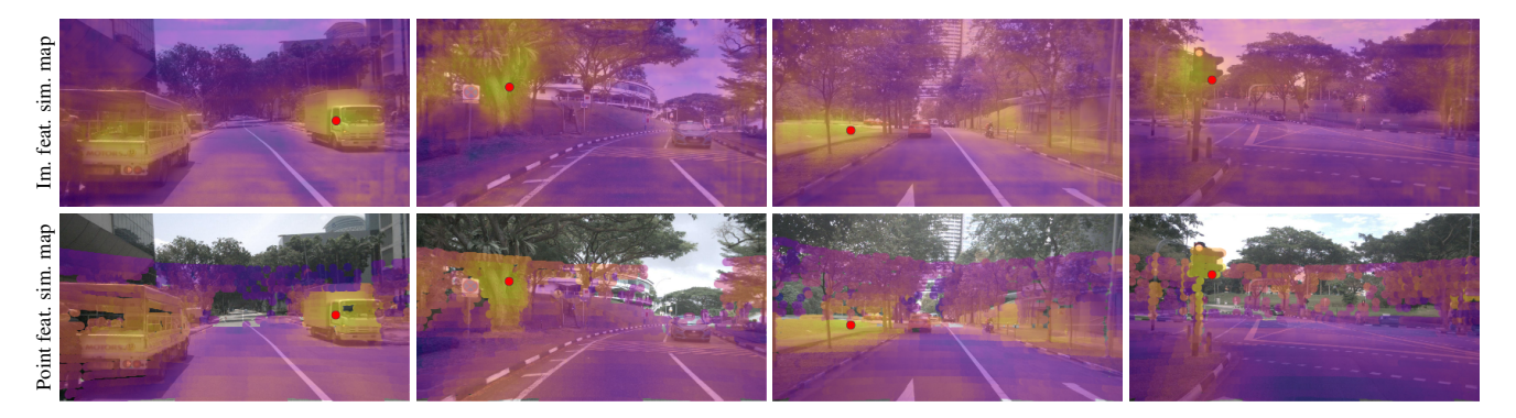
Figure 3. We present the cosine similarity between the SLidR's feature of a query point (displayed as a red dot) and: (a) the pixel features of an image in the same scene (top row - Image feature similarity map); (b) the features of the other points projected in the same image (bottom row - Point feature similarity map). The colormap goes from violet to yellow for respectively low and high similarity scores. We show these maps for two scenes in the validation set of [6].

bounding boxes for cars, cyclists and pedestrians. The performance are compared by computing the average mAP over these three classes in the moderately difficult cases, which are used to rank all methods on this dataset [19].