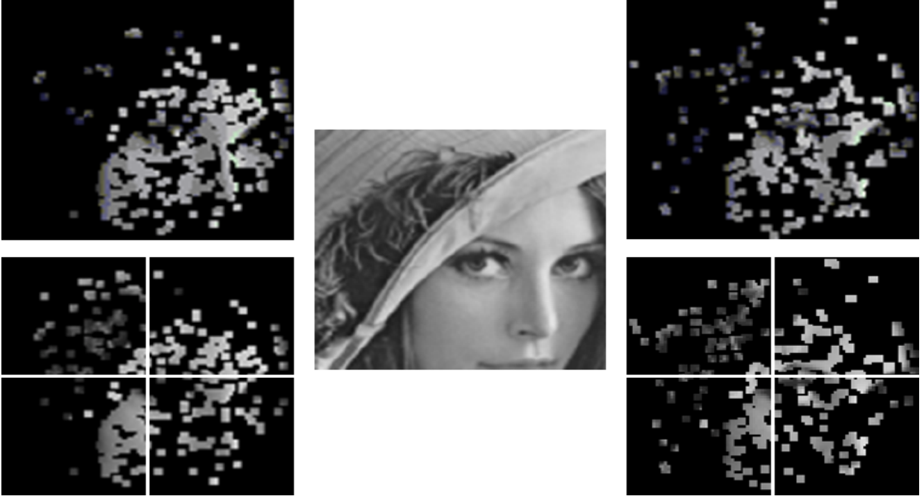
Figure 1. Linear and quadratic subsets learned for a sample template. The top left template shows the linear subsets used with the inverse compositional algorithm and the top right template shows the quadratic subsets used with the ESM algorithm. The bottom row shows the linear and quadratic subsets obtained when the subsets are constrained to be spread evenly over the template. Building such subsets takes less than 30 seconds on a standard computer.

a certain threshold \tau are merged into a final subset \mathcal{E} that will be used during tracking, while the other pixels are discarded. Figure 1 shows examples of linear and quadratic subsets. The threshold \tau was set so that only 20% of the template pixels are contained in the final subset \mathcal{E} .