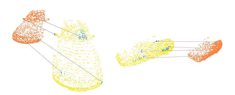
Fig. 2. Illustration of correspondences, found by FLOT (K = 1) trained on n = 8192 (see Section 4.4), between p and q in two different scenes of KITTI<sub>s</sub>. We isolated one car in each of the scenes for better visualisation. The point cloud p captured at time t is represented in orange. The lines show the correspondence between a query point p_i and the corresponding point q_{j^*} in q on which most the mass is transported: j^* = \operatorname{argmax}_j T_{ij} . The colormap on q represents the values in T_i where yellow corresponds to 0 and blue indicates the maximum entry in T_i and show how the mass is concentrated around q_{j^*} .

trained model. For each score and model, we thus have access to 15 values whose mean and standard deviation are reported in Table 1. We present the scores obtained before and after refinement by h.